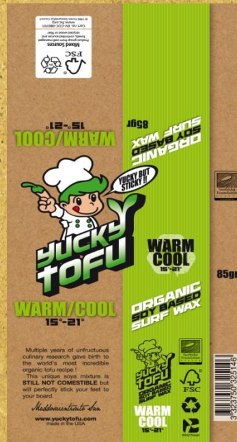
WAX for Warm Water