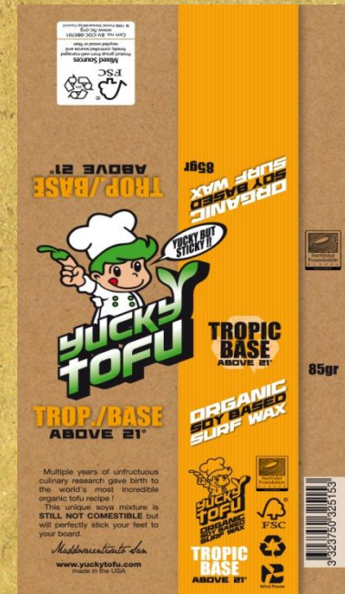
WAX for Hot Water